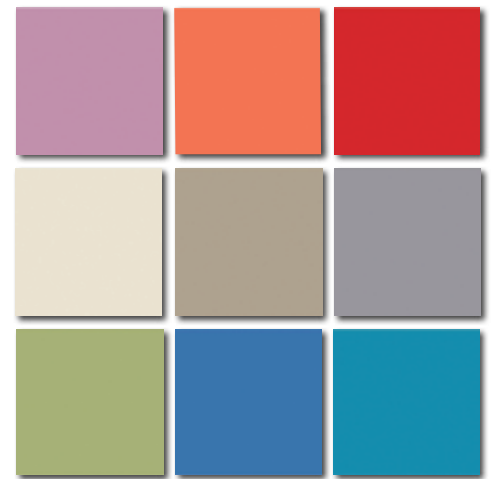
These nine colors represent a portion of the 2011-2012 environmental and interiors color forecast from The Color Association of the United States (CAUS). www.colorassociation.com