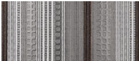
Crossville's UltiMetal, an award-winning Porcelain Stone® tile with a metallic textured finish and an abstract pattern, is a superb example of the new natural and neutral colors in a "timely" format.

Finally, mellow vintage hues connect us to the past. These colors are faded, washed, weathered, or may suggest photo-tints.